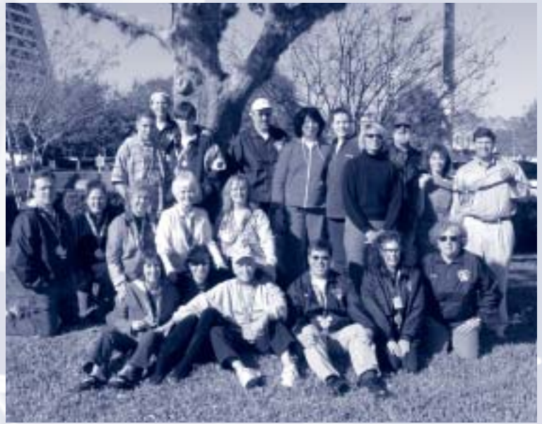
TEAM NACoA kicks back at our post-race barbrque