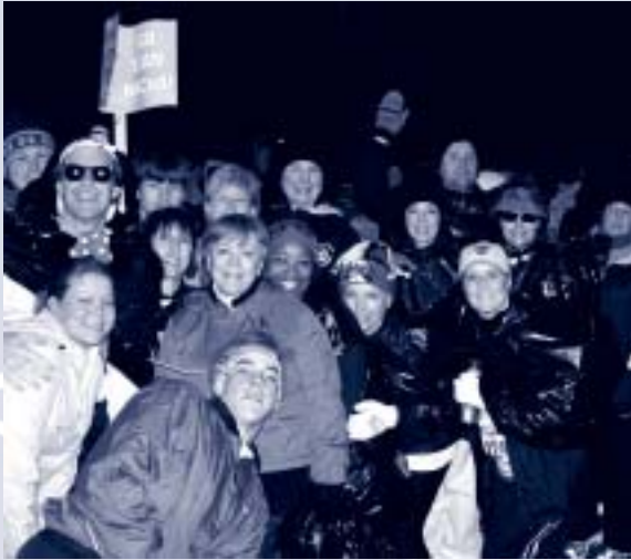
TEAM NACoA huddles at starting line